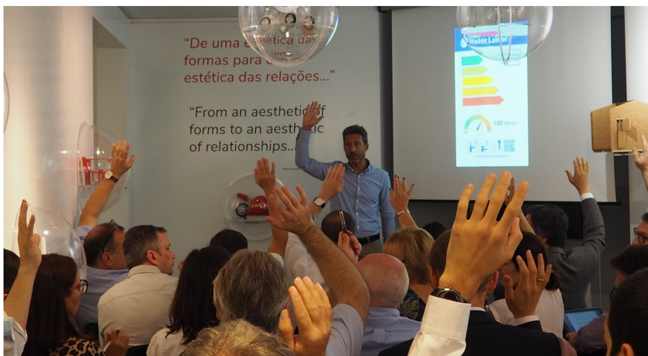
Voluntary agreement of the EBF on 5 July in Lisbon.

With more than 70 stakeholders of the bathroom sector in attendance including manufacturers, brands, test labs, associations and independent consultants, the meeting led to the adoption of a single labelling scheme based on the proposals and contributions of the Swedish Energy Agency, the Swiss Energy, the ANQIP and the European Water Label. The scheme will be presented by the European Association for the Taps and Valves Industry (CEIR) to the European Commission for its subsequent approval as part of a proposal for a Voluntary Agreement. This represents an important step forward for the joint work of the European Bathroom Industry and their sustainability policies.